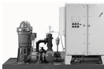
Typical Variable Speed Drive Pumping Station