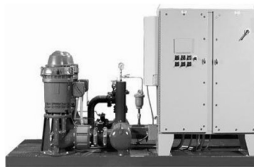
Typical Variable Speed Drive Pumping Station