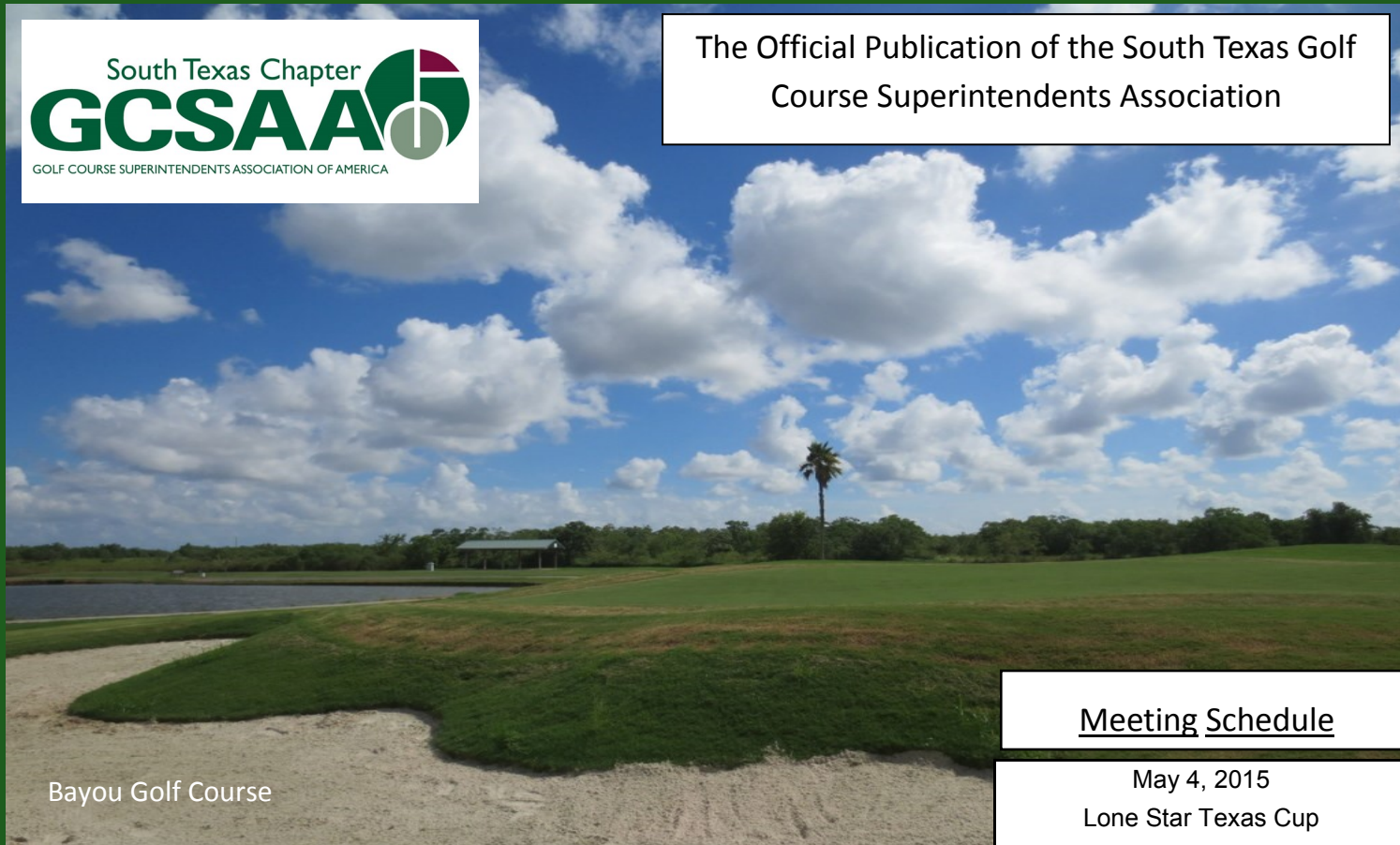
Bayou Golf Course

The Official Publication of the South Texas Golf Course Superintendents Association