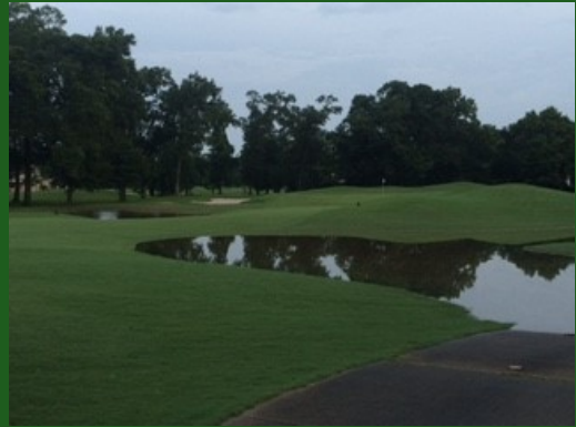
Bay Oaks CC (Kyle Brown, GCS)