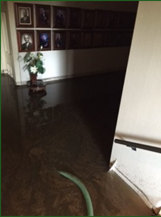
Brae Burn Country Club