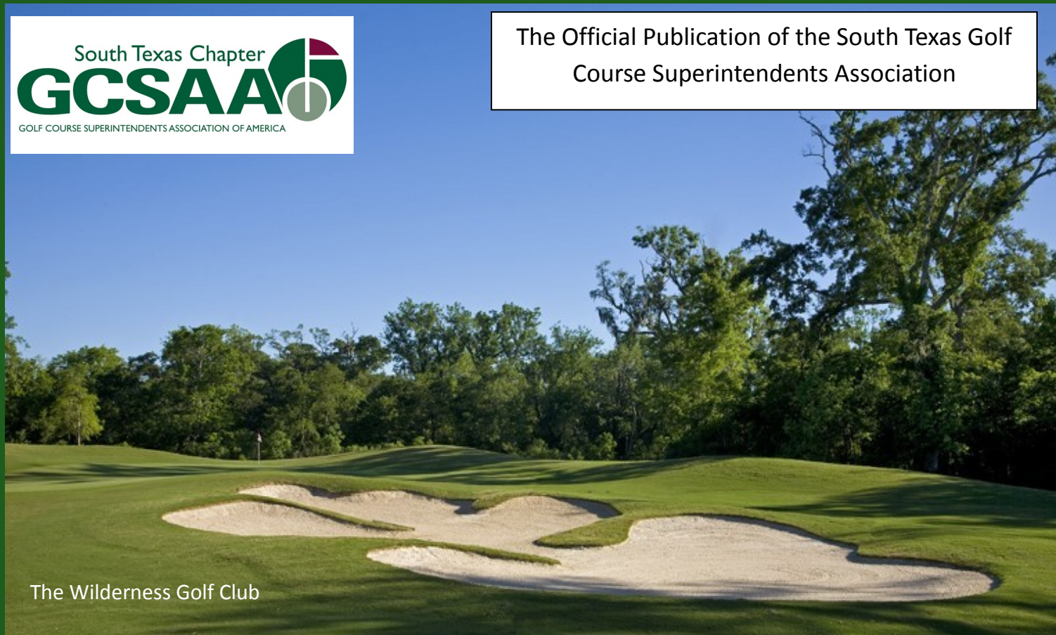
The Wilderness Golf Club

The Official Publication of the South Texas Golf Course Superintendents Association