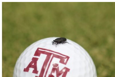
Up-close image of a Hunting Billbug ( Sphenophorus venatus vestitus )