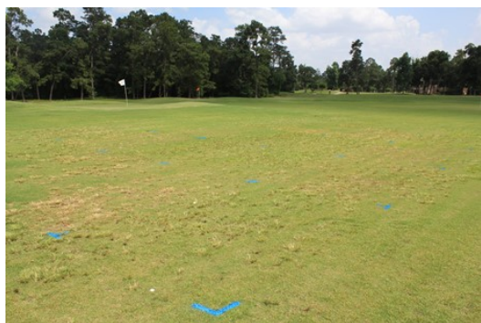
2014 Herbicide Trial on the driving range at The Woodlands Country Club in Woodlands, TX