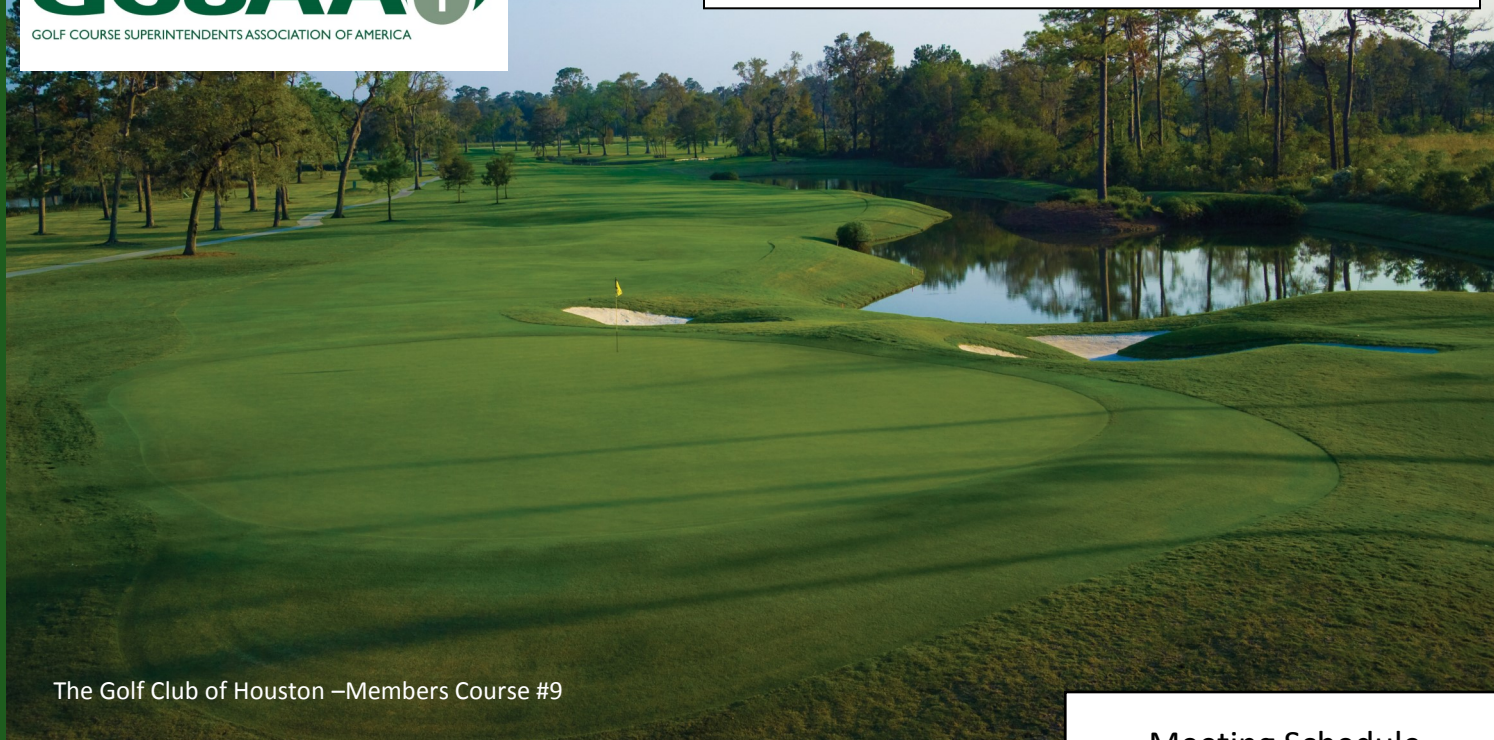
The Golf Club of Houston –Members Course #9

The Official Publication of the South Texas Golf Course Superintendents Association