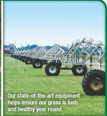
Our state-of-the-art equipment helps ensure our grass is lush and healthy year round.