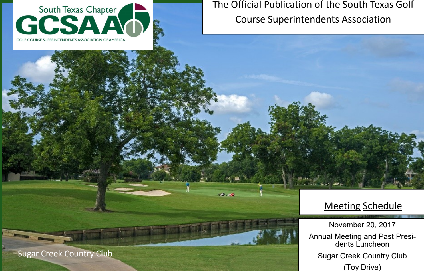
Sugar Creek Country Club

The Official Publication of the South Texas Golf Course Superintendents Association