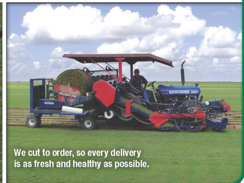
We cut to order, so every delivery is as fresh and healthy as possible.