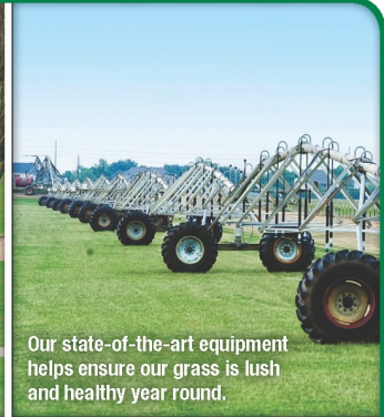
Our state-of-the-art equipment helps ensure our grass is lush and healthy year round.