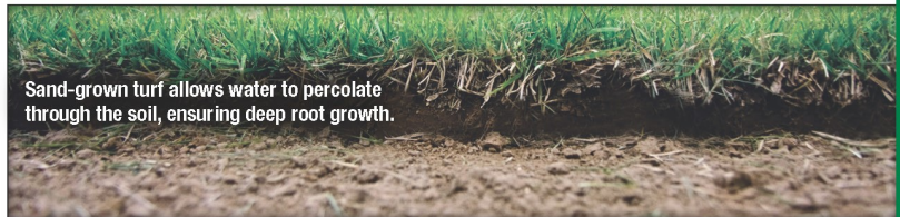
Sand-grown turf allows water to percolate through the soil, ensuring deep root growth.