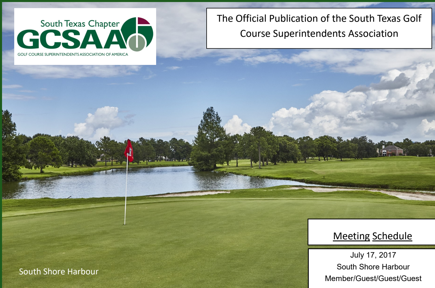
South Shore Harbour

The Official Publication of the South Texas Golf Course Superintendents Association