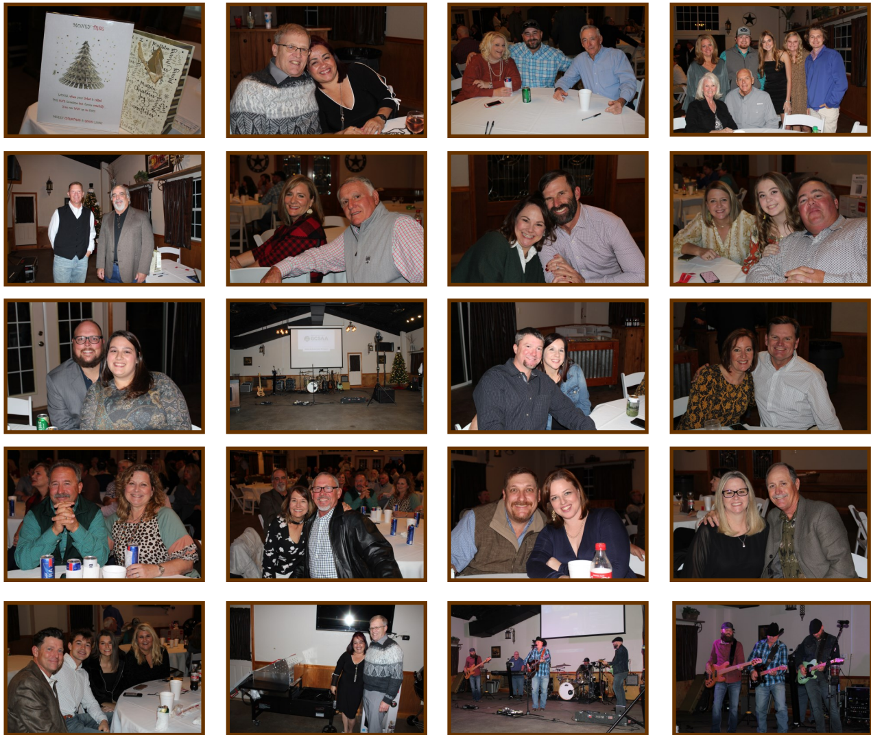
2020 STGCSA Christmas Party Pictures

Thank you to everyone who attended the STGCSA Christmas Party! We gave away over $3,000 in Prizes! Congratulations to all of our winners!