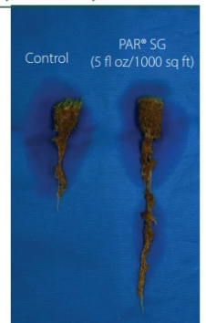
PAR® SG applied weekly at 5 fl oz/1000 sq ft (right) improved rooting in creeping bentgrass turf grown under heat stress in a university trial.

Virginia Tech 2019 Field Study -Dr. Zhang