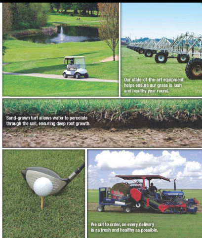
Our state-of-the-art equipment helps ensure our grass is lush and healthy year round.

32601 FM 529 • Brookshire, TX 77423 Phone 281.375.7505 • AllSeasonsTurf.com