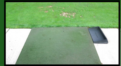
Divots taken late in the season will not heal until growth resumes in the spring.

Most facilities in the northern half of the Central Region have already closed their grass practice tee for the year or the date is fast approaching. The increase in the number of rounds played at many facilities this year resulted in more divoting than typical. When a warm spell is experienced this offseason, or for those willing to brave the cold, golfers should keep all practice on the artificial mats until the grass tee is reopened in the spring, no matter how enticing the pristine turf that is only few steps away appears.