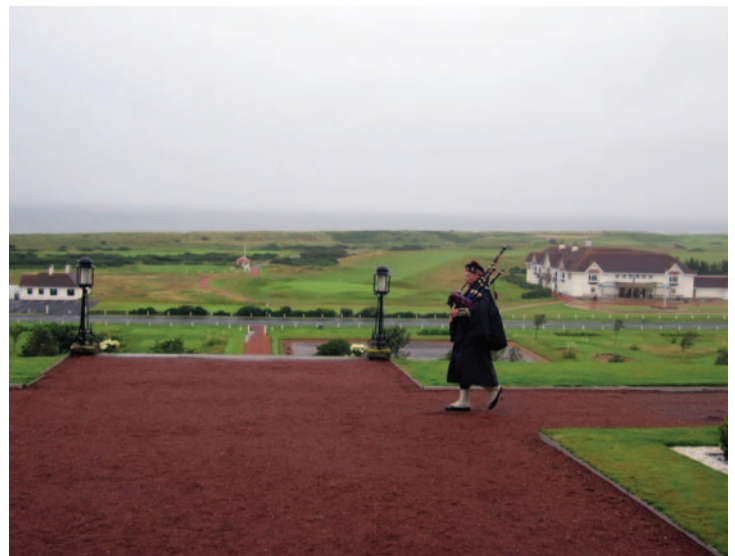
A bagpiper welcomes a cloudy morning at Turnberry, with the 18th green of the Ailsa Course, the clubhouse and the Irish Sea in the background.

Tees are generally built at ground level, fairways are shaped naturally to allow for good drainage (the result can be a variety of uneven lies), most bunkers are small, quite deep, and designed to penalize wayward shots. Some bunkers are main-