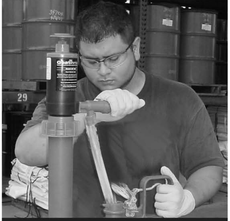
Spill-Proof Pumps That Last for Years no kidding!