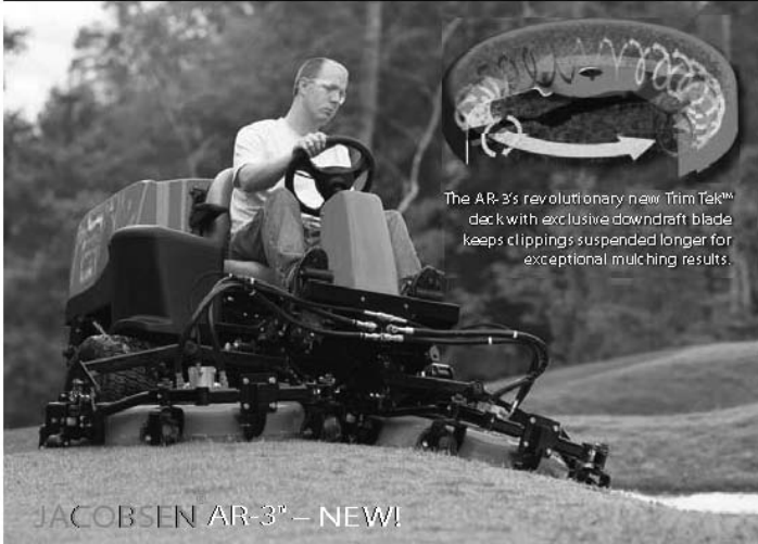
The AR-3's revolutionary new Trim Tek™ deck with exclusive down draft blade keeps clippings suspended longer for exceptional mulching results.